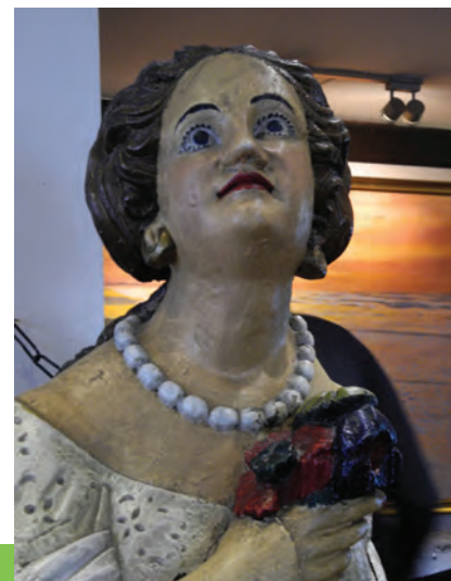
The Straand Hotel's figurehead appears to be La Stupenda, Dame Joan Sutherland.

motorcycle clothing to wear. Much as I like my BMW suit, I draw the line at that and press one of the hotel's towels into use as a kilt. Well, it were kilt according to me... I didn't really notice, but it appears that I scandalised a few other, older (?) guests. In vain I maintain that I am a Blank Scotsman, wearing my white clan tartan. Some of my fellow riders are introduced to akvavit that evening, and regret it in the morning, I suspect.