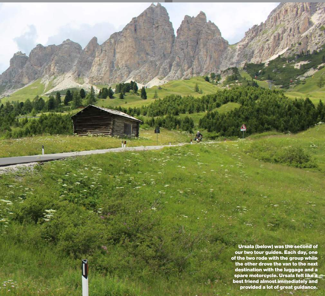
Ursala (below) was the second of our two tour guides. Each day, one of the two rode with the group while the other drove the van to the next destination with the luggage and a spare motorcycle. Ursala felt like a best friend almost immediately and provided a lot of great guidance.