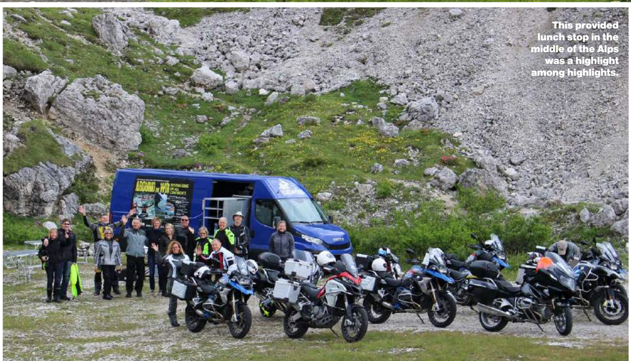
This provided lunch stop in the middle of the Alps was a highlight among highlights.