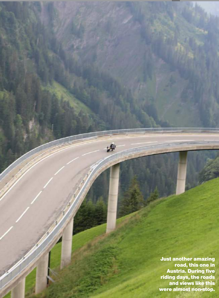
Just another amazing road, this one in Austria. During five riding days, the roads and views like this were almost non-stop.

That is where those side bags on the bike and van transporting additional luggage really comes in handy. Recommended items include: