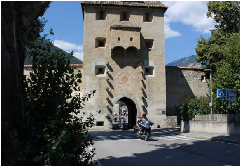
Edelweiss Tours believes that motorcycles are the best way to experience a location and we couldn't agree more. Our group of fourteen people zipped around amazing roads, stopped at spectacular locations and enjoyed the riding as much as the history and scenery.

with helpful riding, group riding and safety recommendations including the “Edelweiss line” suggested for the narrow European roads. I especially appreciated the proper procedure for using roundabouts, which are abundant in Europe. The safety and riding tips were reinforced every day during the route briefings that also included the historical highlights for the region. Edelweiss offers options to rent bikes and pre-loaded GPS routes but after spending the week with our guides, I recommend that option, especially if it is your first motorcycle tour outside the U.S.