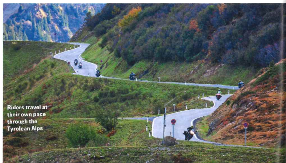
Riders travel at their own pace through the Tyrolean Alps