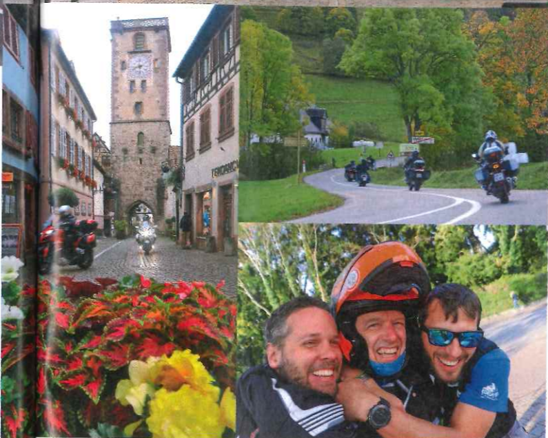
Above left: Leaving Ribeauvillé