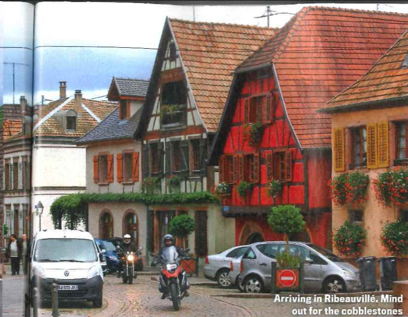
Arriving in Ribeauvillé. Mind out for the cobblestones

For more information see www.edelweissbike.com